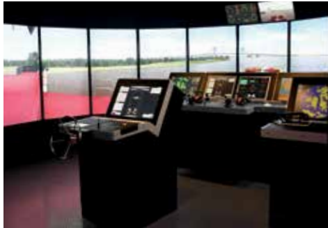
SHIP BRIDGE SIMULATOR