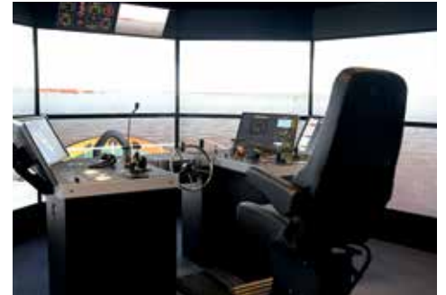
TUG BRIDGE SIMULATORS (2)