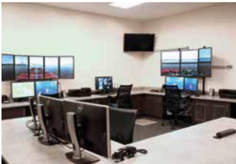
BRIDGE AND ENGINE ROOM SIMULATOR CONTROL ROOM

The Houston Pilots Maritime Simulation Suite houses three state-of-the-art, full-mission bridge simulators featuring 65 hydro-dynamically accurate vessels that can be operated in 10 regions worldwide. Additionally, the suite comprises a simulation control room to monitor, record, and remotely control simulation scenarios, along with debrief room equipment with a teaching computer, internet, and overhead projection. This room is the main entrance to the entire simulation suite, offering potential donors the opportunity to be seen not only by current students but also by lawmakers, legislators, prospective students, industry partners, and other visitors.