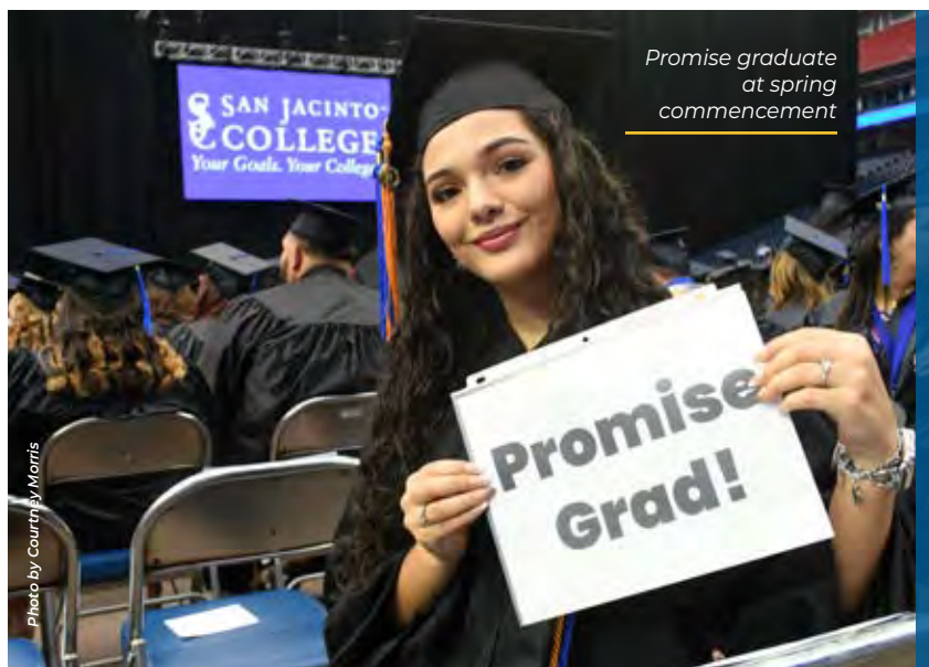
Promise graduate at spring commencement

Q: The 3-Peat Rule, charging students attempting to take a course for the third time a $100 fee, was passed by Texas to discourage students from repeating courses. Are 3-peat charges covered by Promise?